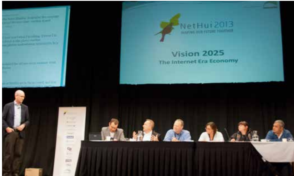
Images from the 2013 NetHui event based in Wellington.